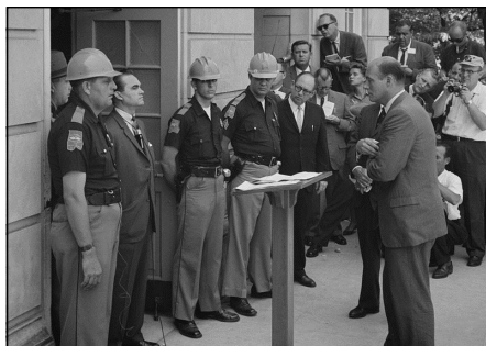
Governor Wallace makes his stand in the door of the University of Alabama.

The court's decision rejected the "separate but equal" doctrine the court had approved 58 years earlier in Plessy v. Ferguson . Now, all-white schools could no longer reject black students. Although the Court's decision was aimed at K-12 public schools, the decision was also applied to colleges and universities. But not everyone was happy with the decision in Brown . In 1963, Alabama governor George Wallace spoke out against letting black students attend the University of Alabama. He stood in the doorway to block two black students from being able to register. The conflict ended when President Kennedy ordered the Alabama National Guard to the scene.