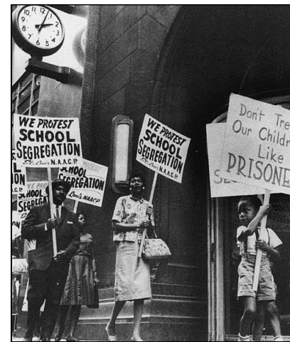
Parents and kids protest segregation

In some places, schools for black children were run-down and lacked things like gyms or cafeterias. In many places, there were school buses for whites but not for blacks. Parents had to send their kids across town to school when there were schools right in their own neighborhoods. But the closer schools were for whites only.