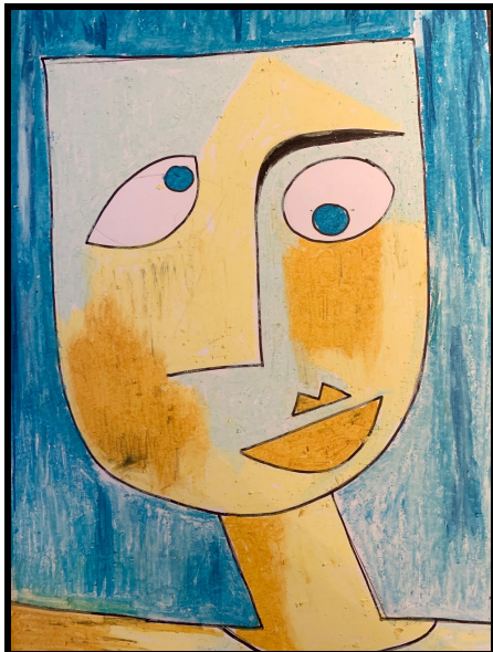
Lesson Example, Oil Pastel

3. Draw the facial features , (eyes, nose, lips, ears) using simplified shapes you’d like to use. Paul Klee generally put the facial features in the “correct” spot, but that doesn’t mean you have to! Remember we are being INSPIRED by Paul Klee and not copying him. Feel free to explore placing the eye as a nose, stretch out the nose all the way down to the chin or adding hair!